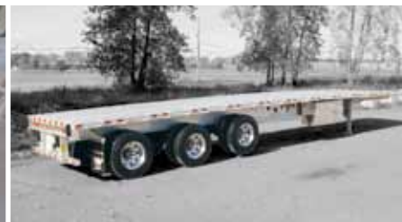
Variety of axles configuration available