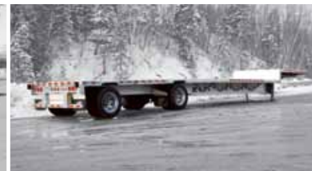
Drop deck models